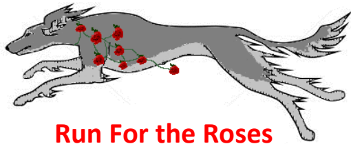
Run For the Roses

We will not be holding a run for Best in field on Sunday. Instead we will be holding the Third Annual Denny Reed Memorial Run. All Best of Breed Winners from Saturday and Sunday are eligible to participate. Your dog must receive a qualifying score on both days (Saturday and Sunday) and may not forfeit any runs including run offs on each day. All eligible hounds will compete in randomly drawn stakes at the completion of Best of breed runs on Sunday. Any ties will be decided by Run offs